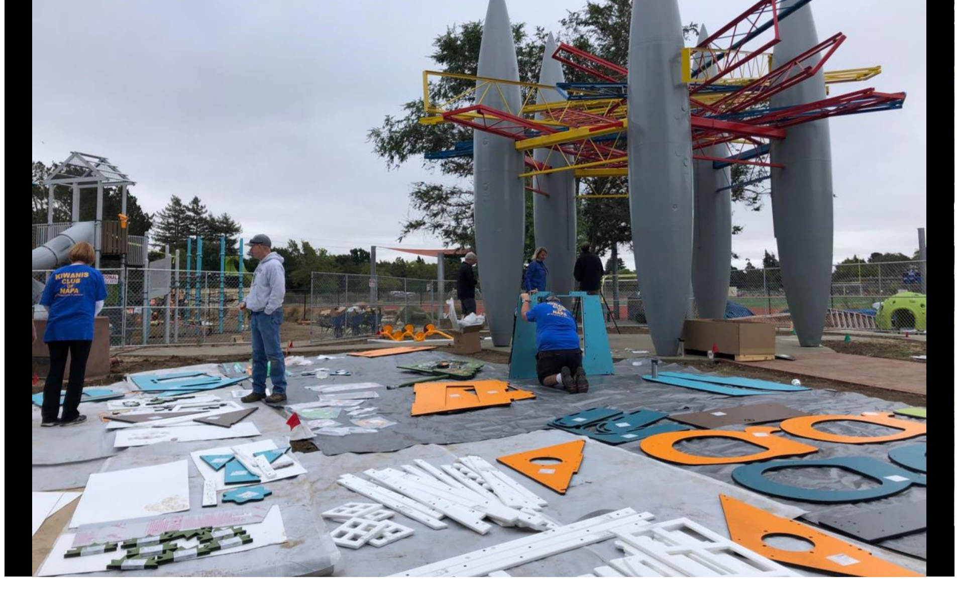
Volunteers organize Playground Fantástico pieces next to a newly repainted art piece by Gordon Huether during a playground build event in Napa on Saturday morning.